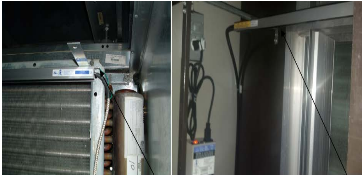
Shielded Cable System with Integral Ground Wire